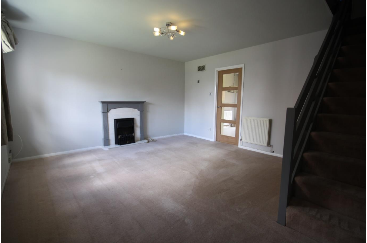
25 Grindle Close - £1200pcm