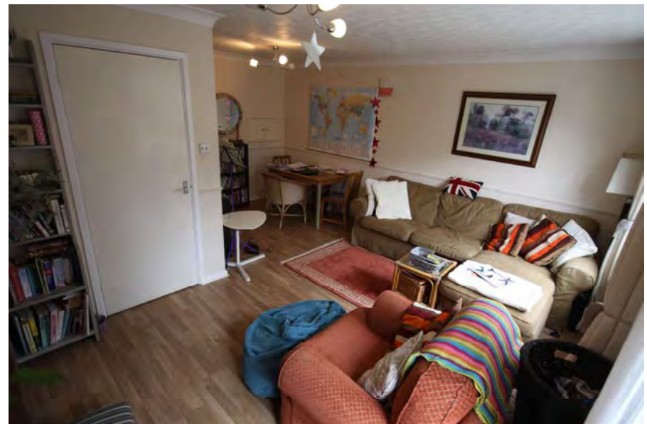
LOUNG / DINER