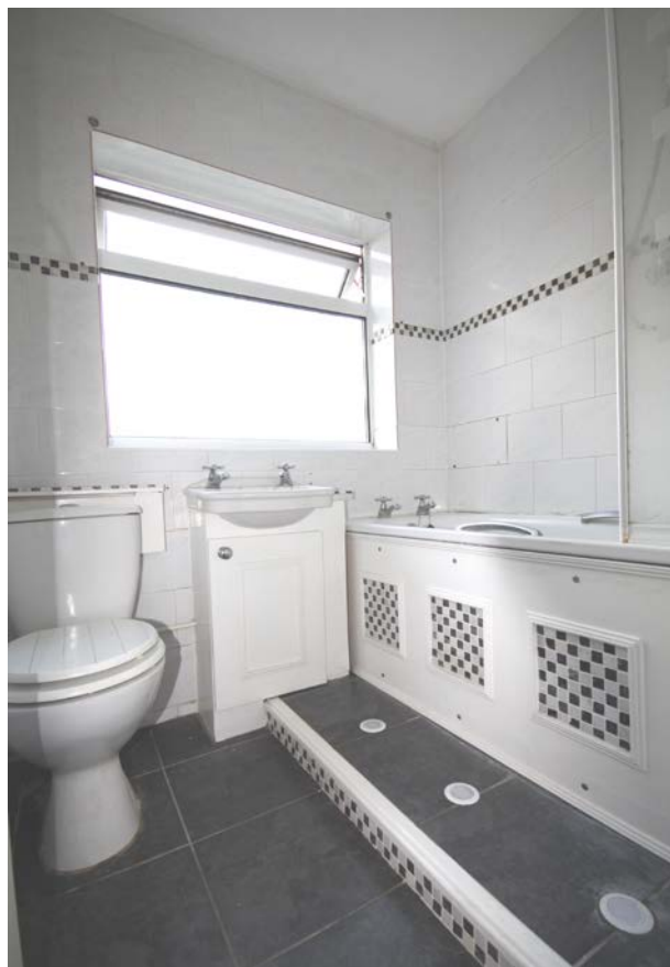
Bathroom 9' 7" x 9' 2"