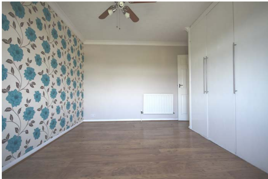
Bedroom 1 12' 2" x 8' 10"