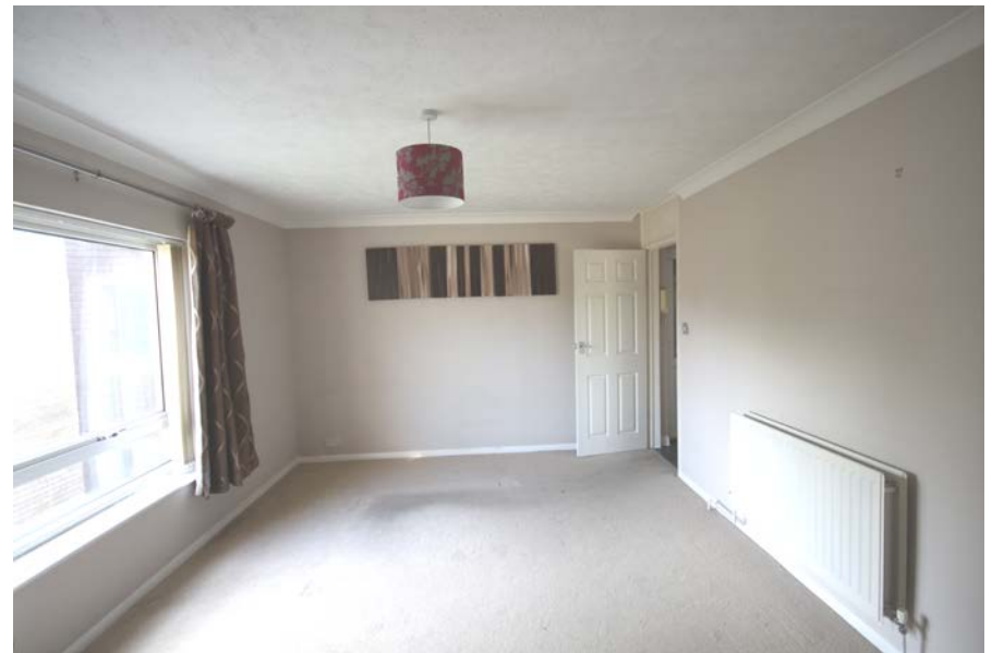
Lounge area 16' 3" x 11' 6"