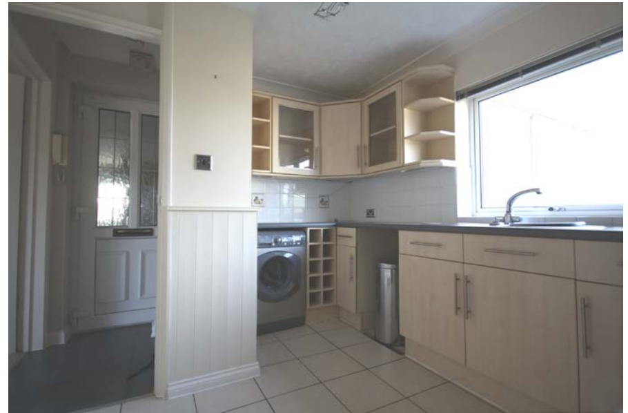
Kitchen area Base and eye level cupboards and drawers for good storage 11' 6" x 9' 2"