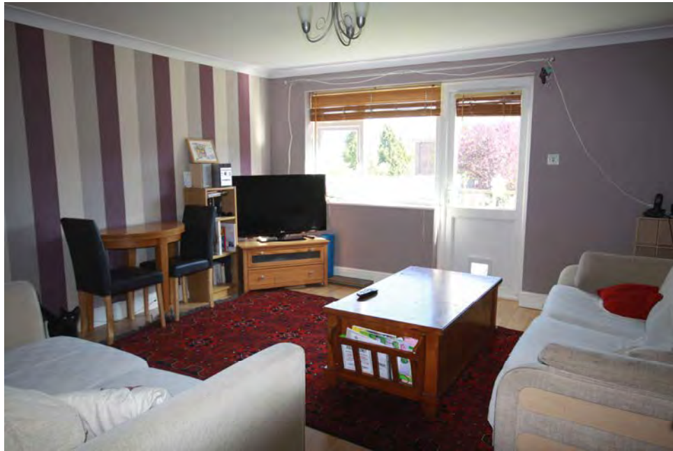
LOUNGE / DINER