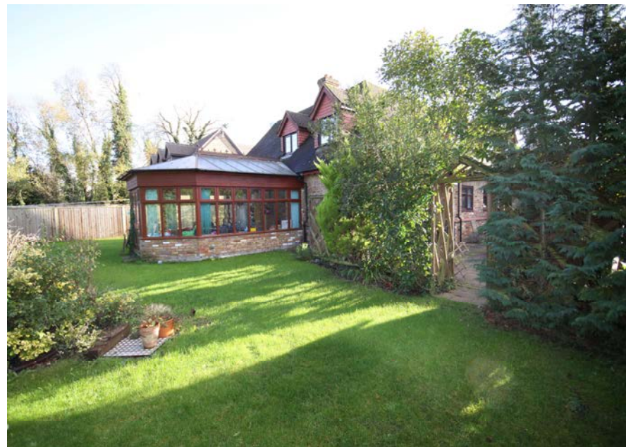
Rear Garden from right