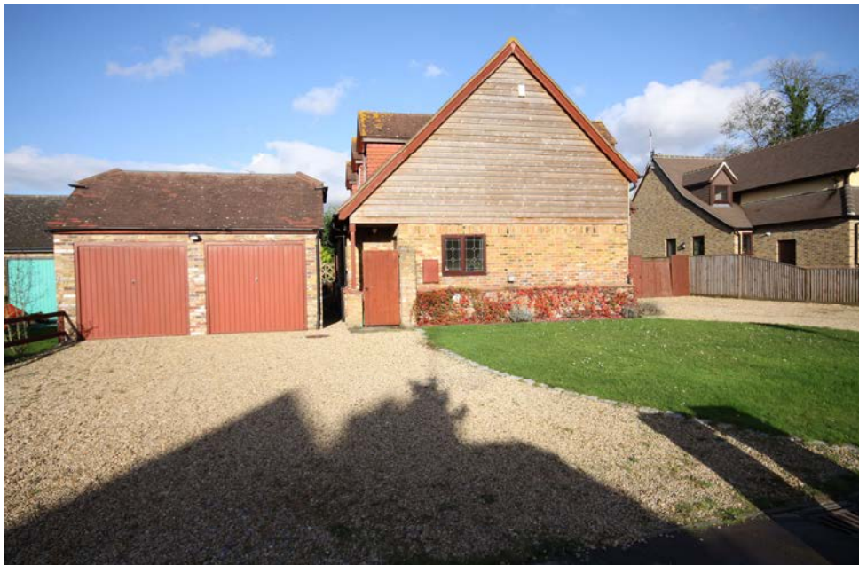
Double Garage and second driveway