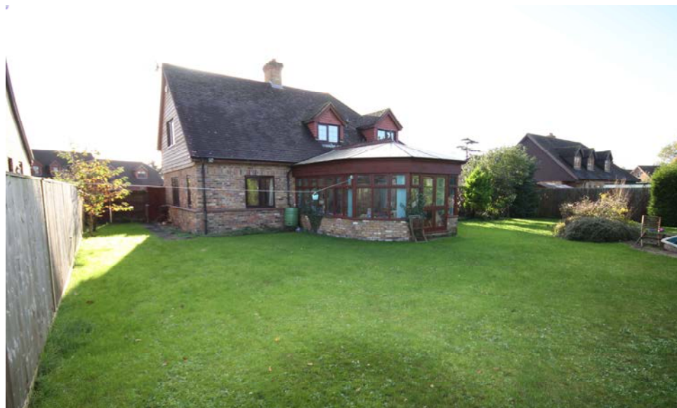
Rear Garden from Left