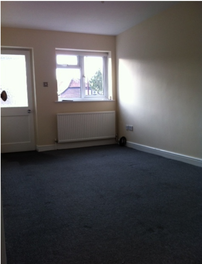
LIVING ROOM / DINER