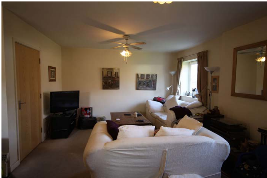
Lounge / Diner